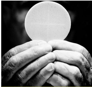
JESUS IN THE EUCHARIST INVITES US TO JOIN HIM AT MASS.

Him and having a meal with Him. This is the Holy Mass! He comes to us physically in the Eucharist and gives us His own Body, Blood, Soul, and Divinity at every Mass! Christ is present, He's waiting for us to come spend time with Him and tell Him how our week has gone, the joys, the struggles, the highs, the lows.