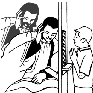
THE PRIEST, IN THE PERSON OF CHRIST, HEARS YOUR CONFESSION.