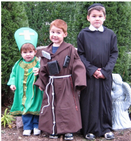
ST. PATRICK, ST. ANTHONY (WITH LOST THINGS ATTACHED TO HIM!), ST. DOMINIC (OR OTHER DOMINICAN PRIEST)

JUST SOME EXAMPLES OF SAINT COSTUMES TO HELP YOU!